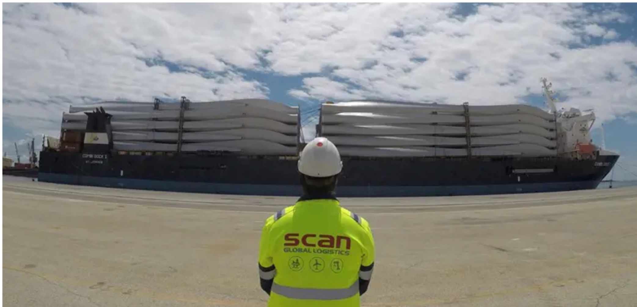
Photo of the record-breaking shipment, consisting of 198 wind turbine blades in one single vessel.

The loading of 198 wind turbine blades was the largest single-vessel blade shipment of blades to date, breaking the previous record of 156 blades on a single ship. An exciting task for Vestas that required us onsite for the whole loading process to supervise and ensure that everything went as planned.