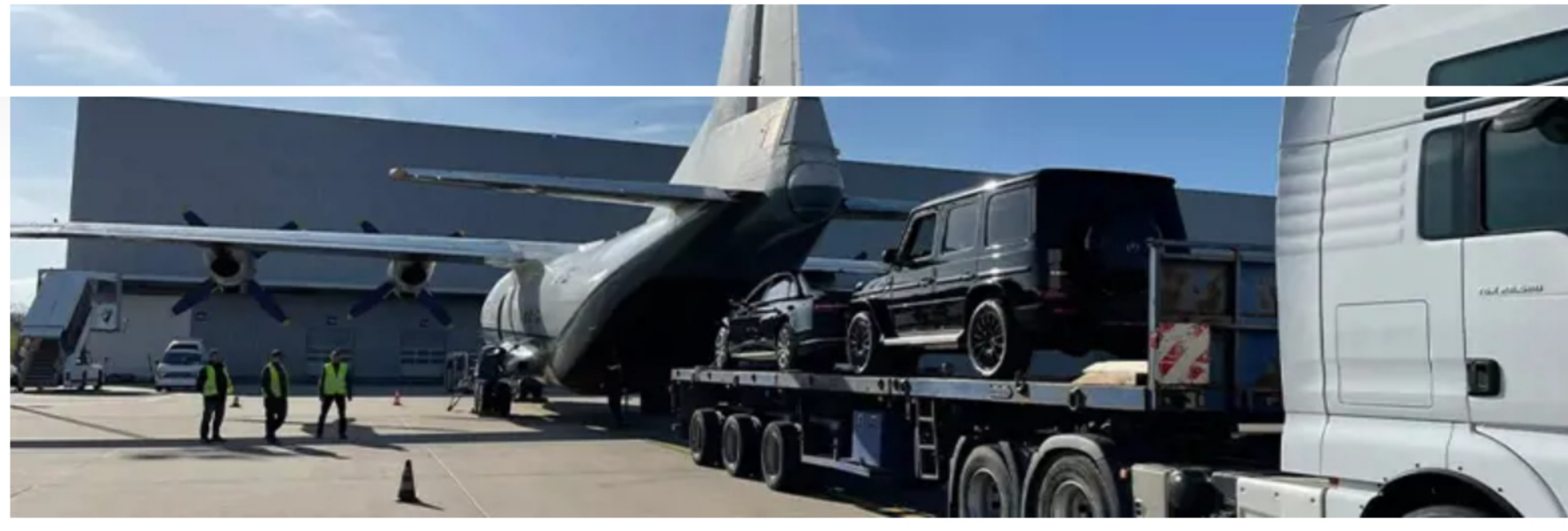
Photo of the Antonov AN12 with the Audi A8 security car and a Mercedes G500

At 51 years (and 4 months), the beautiful Antonov AN12 proved the reliable solution when an Audi A8 security car and a Mercedes G500 (a powerful machine in extreme terrain) needed safe delivery from Germany to Rwanda.